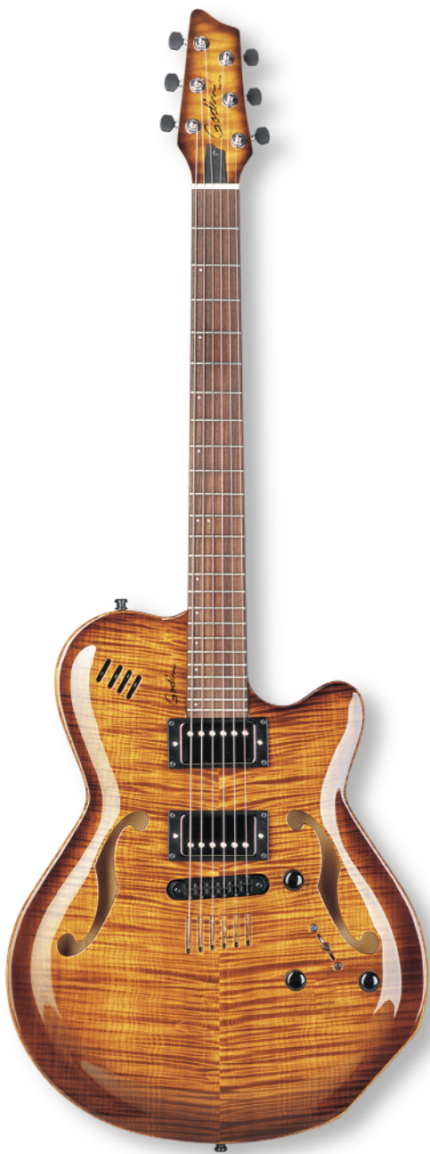
Flat Five X